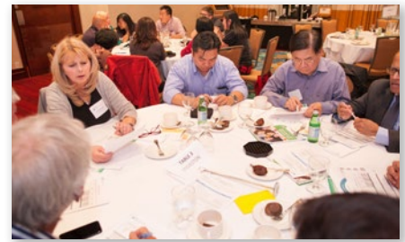
Neighbourhood Networks meeting

In 2017, we will continue to build our existing Networks according to member input, and seek opportunities to build new ones within Richmond.