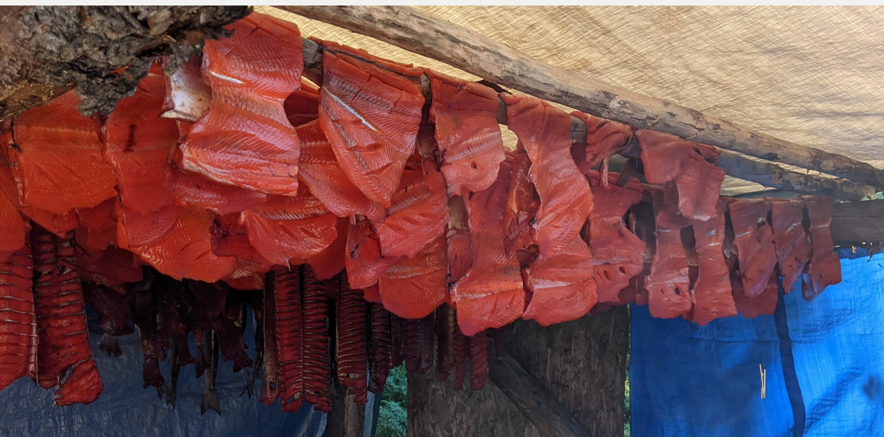
Smoking Salmon at the TNG Gathering, September 2022

You can find a copy with live links on the Division website here . The toolkit will eventually live on the CIR PCN cultural safety website that is under development.