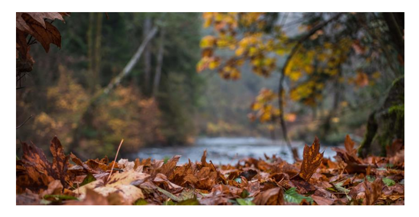
DIVISION NEWS ~ UPDATES