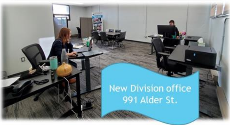
LifeLabs - Newsletter

Attached is the latest copy of LifeLabs physician newsletter.