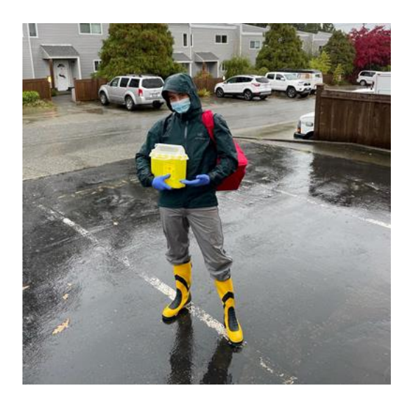
New NP Joins the North Island Medical Clinic