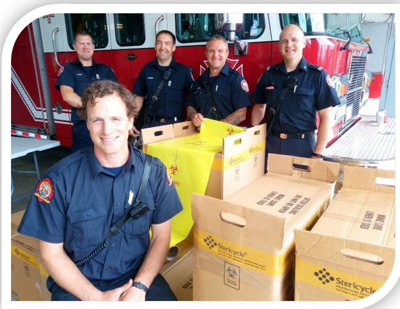
2019 sharps disposal collection