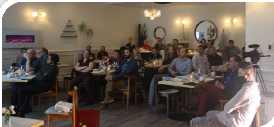
Pearl Fest Audience March 2022

IT HAS MADE A HUGE DIFFERENCE. THIS PARTICULARLY BECAME EVIDENT WHEN WE HAD OUTSIDE FACILITATORS.