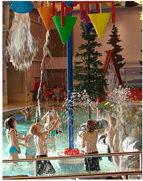
Sechelt Aquatic Center