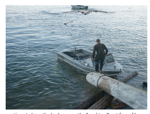
Beachcombers continue to keep the harbours on the Sunshine Coast free of logs that are a danger to boaters. Molly's Reach was the hangout of the original Beachcombers, a CBC production that ran from 1972 until 1990.

To the north west of Pender Harbour, a BC Ferries terminal is located in Earl's Cove where you can catch a ferry to Powell River (the upper Sunshine Coast). Egmont , adjacent to Earl's Cove is home to the Skookumchuck Narrows where the tidal waters rushing through a small gap create a "reversing falls" effect. A park and hiking trail take you to the Narrows where at the change of tide you can watch kayakers riding the waves.