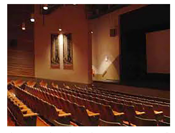
The Ravens Cry Theatre, home to live stage presentations as well as first run movies.

Throughout the year, special events are planned that cover an array of interests and activities. Outdoor festivals are in abundance in the warmer months, including the Gibsons and Pender Harbour Jazz Festivals, the Fibre Arts Festival, the Outrigger Canoe Races, the Sleepy Hollow Rod Run and Show and Shine Car Show, the Ruby Lake Wood Duck Festival, parades and a variety of water-related events such as regattas, classic boat reunions, Sea Cavalcade and so much more. Sechelt's Festival of the Written Arts in August is one of the Coast's most popular events.