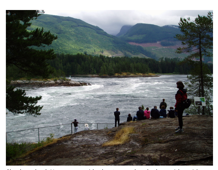
Skookumchuck Narrows provides boaters and on-lookers with exciting sights during tidal changes each day.

www.outdooradventurestore.ca (604) 885-8838 or 1 (888) 661-1056