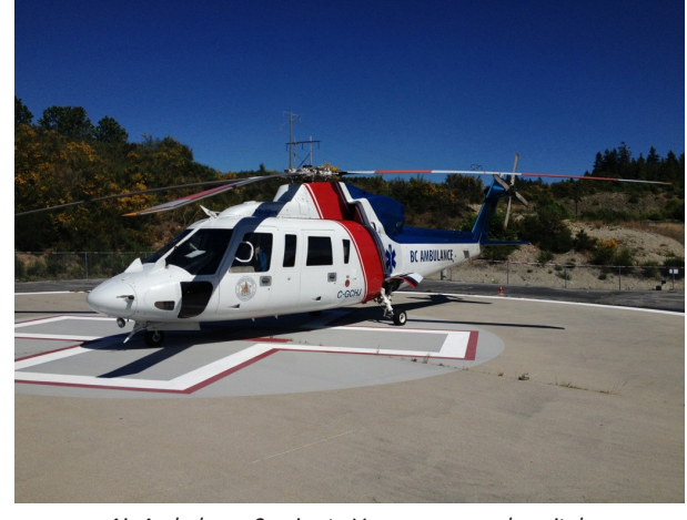
Air Ambulance Service to Vancouver area hospitals

4991 Gonzales Road, Madeira Park (604) 883-2841