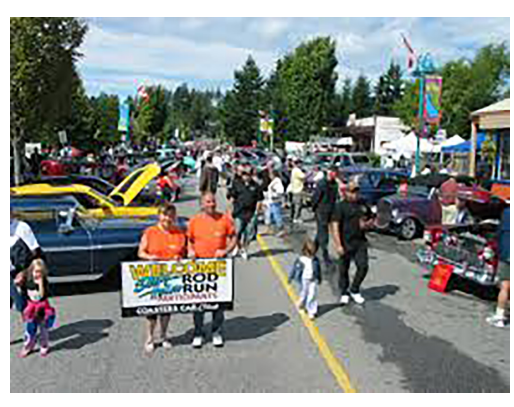
Sleepy Hollow Rod Run Car Show.

A great free app to download on your iOS / Android device is the Sunshine Coast B.C. Tourist & Travel Guide . It has all the information you need to discover the Sunshine Coast.