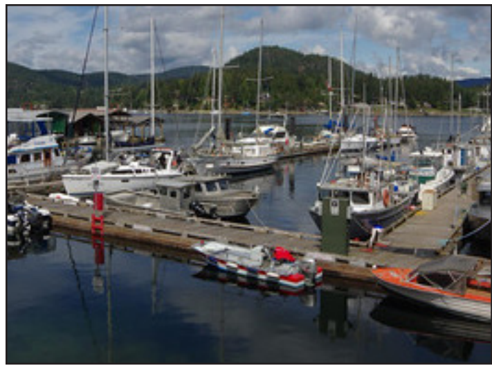
Madeira Park Government Dock

Just up Highway 101 and off onto Redrooffs Road, brings you to Halfmoon Bay. The Halfmoon Bay area is home to a number of artists and artisans as well as home-based small agriculture and food products. The Historic General Store and Welcome Woods markets provide neighbourhood shopping opportunities.