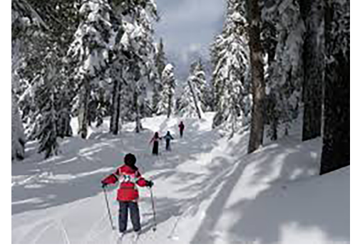
Dakota Ridge, a winter playground in your back vard.

For shuttle service- please contact Alpha Adventures. http://www.dakotaridge.ca/