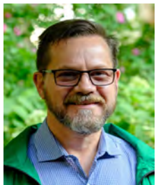
Dr. Greg Selinger (Chair)