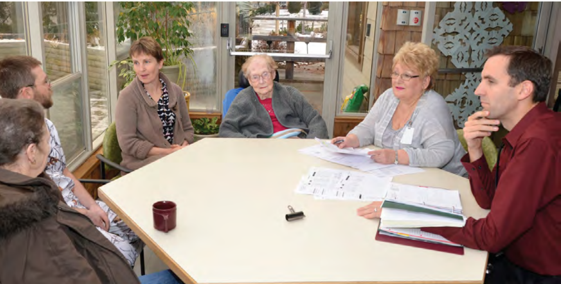
(Above) A care conference taking place at Dr. Andrew Pavillion in Summerland, using a newly developed conference model. In attendance are family members, a care aide, the resident, the care conference coordinator and a physician.