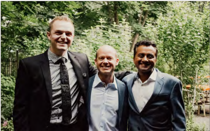
2019-2021 Family Medicine Residents