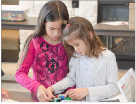
SOS Rural Corridor physicians and their families at a recent Get Connected Event