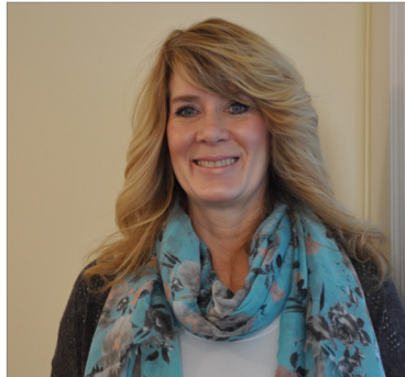
Keremeos Community Worker