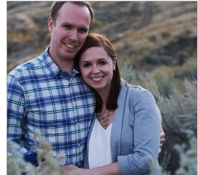
Ask a Specialist/Tell a Specialist