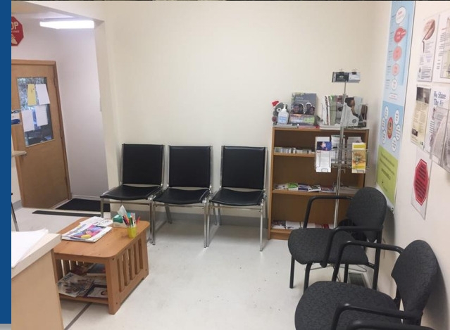
Kyuquot Health Centre