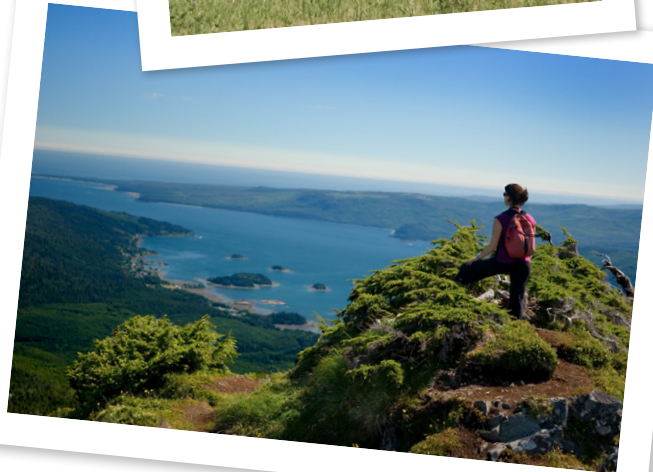
Top: White (Kermode) Bear, Terrace Bottom: Haida Gwaii