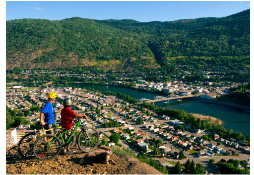
View from The Bluff near Kootenay Boundary Regional Hospital, Trail