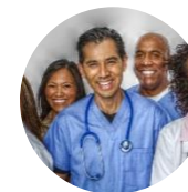
RECRUITMENT & RETENTION