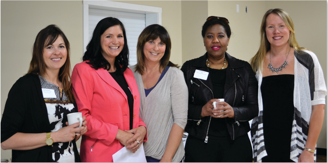
Photo: The team on MOA Day.