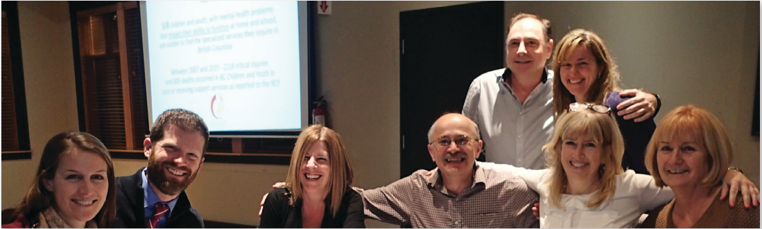
Above: CYMHSU group.