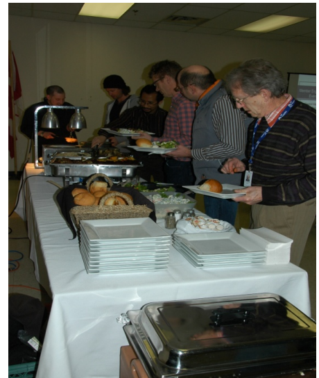
MEMBER BUFFET DINNER