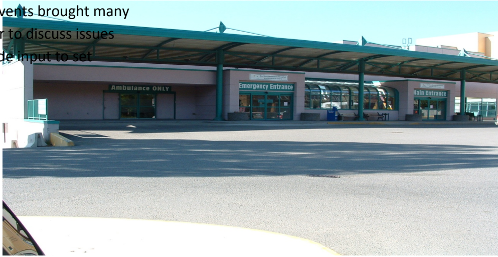
CARIBOO MEMORIAL HOSPITAL EMERGENCY ENTRANCE, WILLIAMS LAKE

With 46 members, the Division has, in its first year of operation attracted over 95% of family Physicians in the region. Two member Engagement events brought many area Physicians together to discuss issues and concerns and provide input to set Division priorities