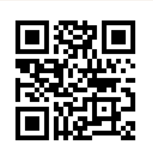
Visit Encompass Pregnancy Care website

Encompass Pregnancy Care Cranbrook is a team-based pregnancy care practice co-located in Cranbrook's Urgent and Primary Care Centre (UPCC). The new model launched officially in May 2022 and is an innovative approach to sustaining maternity care in Cranbrook and area.