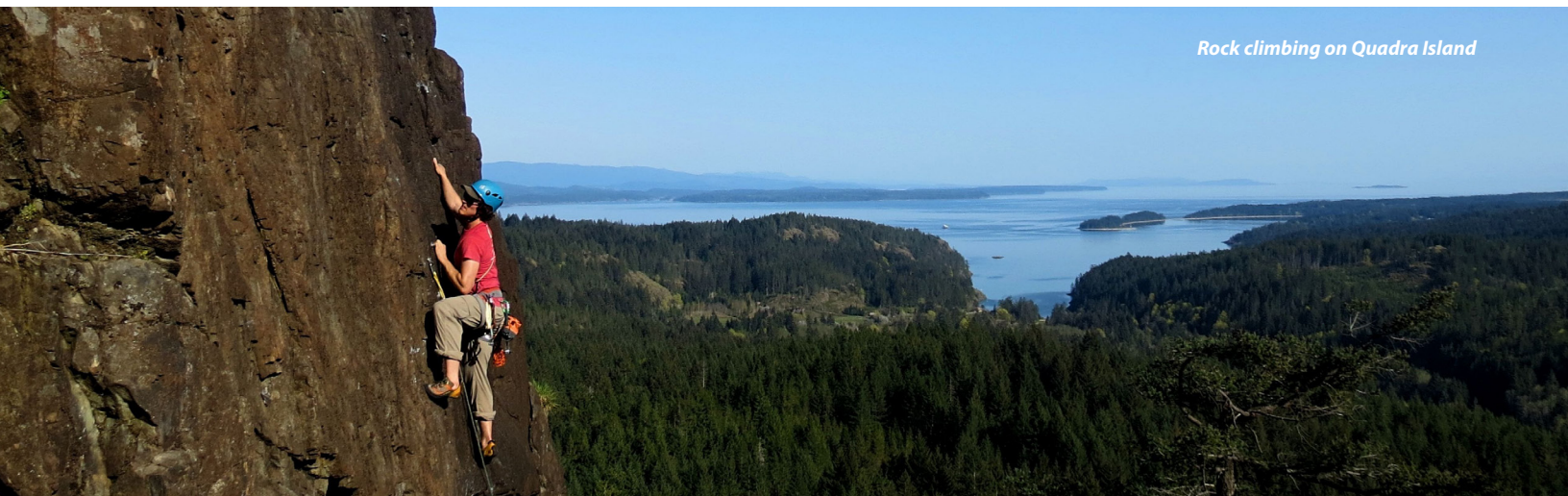
Rock climbing on Quadra Island

Details of considerations for urgent and non-urgent pharmacy issues here .