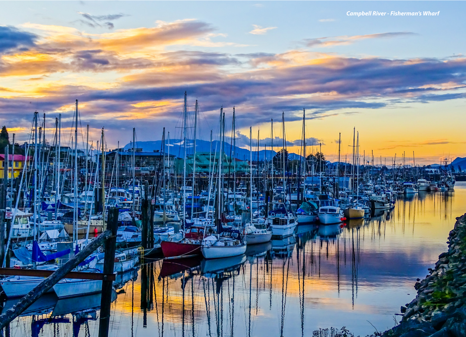
Campbell River - Fisherman's Wharf

We honour and express our gratitude for living and working on the traditional territories of the Coast Salish, Nuuchaltn, and Kwakwaka'wakw first peoples of Vancouver Island and surrounding islands.