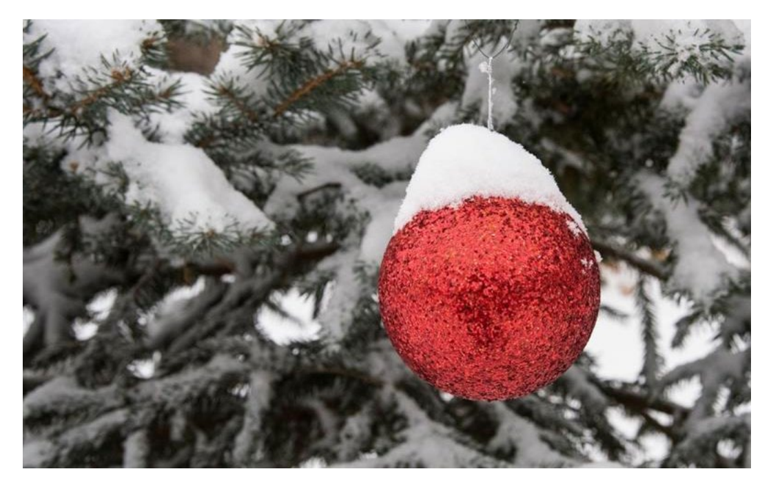
Wishing you and your family a wonderful holiday season.