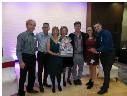
Team Doc Martins takes the prize!