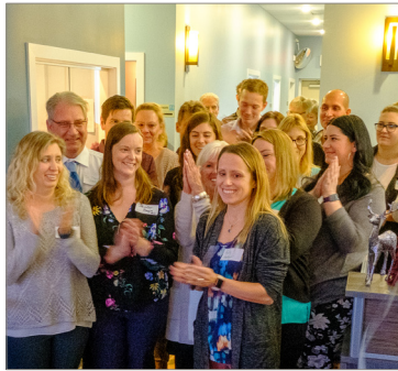
PRIMARY CARE NETWORK NEWS