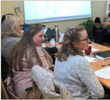
ONE PATIENT, ONE CHART