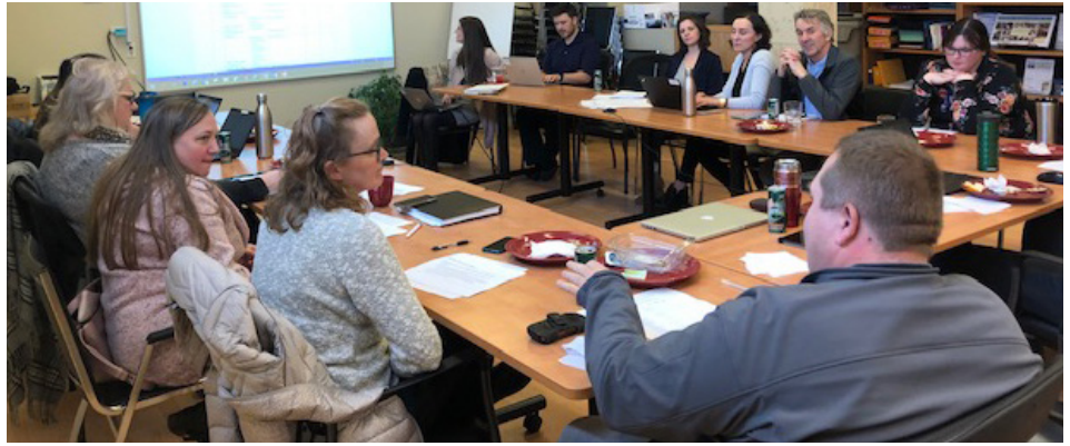
Physicians, IH, Telus and SOS Division staff discuss merging databases as part of a pilot project called Innovation Hub

3. Imagine being a locum and not having to set up MedAccess at every location where you work. You'd arrive to work and you'd be ready to go, with