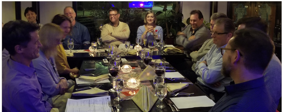
The SOS Division plans to hold a member engagement meeting in spring 2020 to continue to discuss how local primary care providers see themselves working within our local family practice network. Shown above is a Penticton engagement meeting held in November 2019

By being proactive and working together, we aim to figure out how to maintain this evolving network so