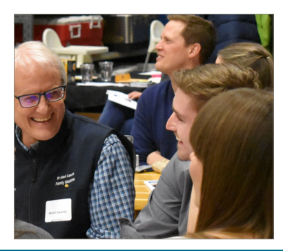
Family Medicine Expo