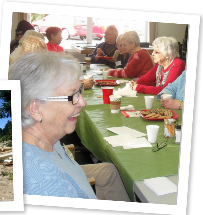
Adult Day Program, Port Hardy

Rural and Remote Division supports 12 of the 64 Local Action Teams across BC. A number of physicians and coordinators are working with a diverse cross-section of local service providers and stakeholders to improve access and coordination of mental health services for children, youth, and their families.