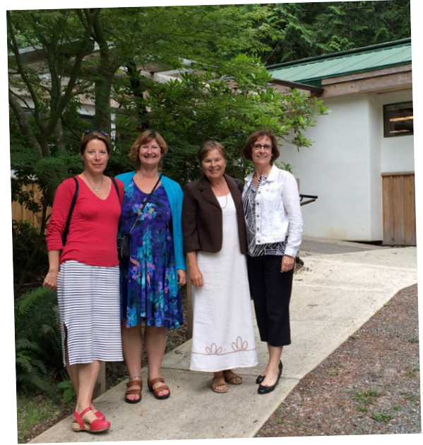
Bringing telehealth to Hornby Island

Fostering a Collective Rural Voice and Influence – we will be strengthening opportunities for member engagement and leadership across our Division, focusing on priority areas such as primary health care, telehealth, small communities, patient transport, and rural locums. In addition, we will continue to foster partnerships 'through a rural lens' with rural divisions, health authorities, and other organizations.