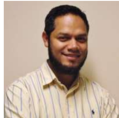
Doctor of the Month