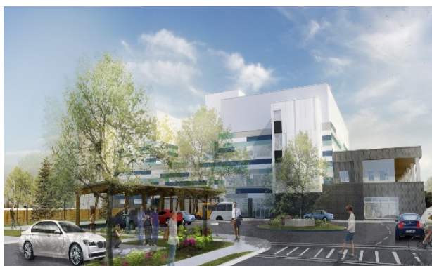
Rendering of the new Campbell River Regional Hospital.

The current hospital is being replaced with a new 95 acute care bed facility scheduled to open April 2017.